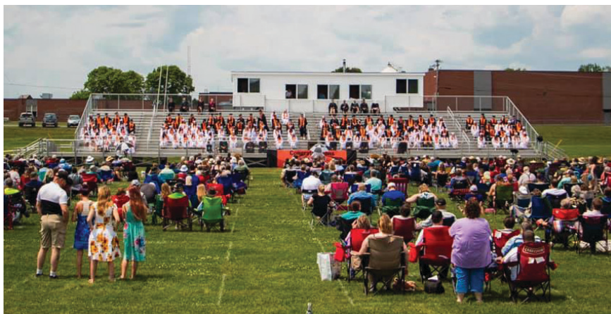
Skowhegan Area High School River Hawks Class of 2021 Graduation was held June 5th on the SAHS Football Field.